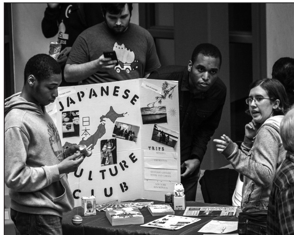
Members of the Japanese Club at MCCC’s Club Fair

As an activity, to deal with stress, anyone can build a medicinal stress ball-in-a-cup game at home. These days, most stressors are psychological rather than physical. When a person is stressed, the body tightens up—so the physical release of squeezing a medicinal stress ball helps to let go of some of that energy. You can squeeze the medicinal stress ball—with a tight fist, as hard as you wish!