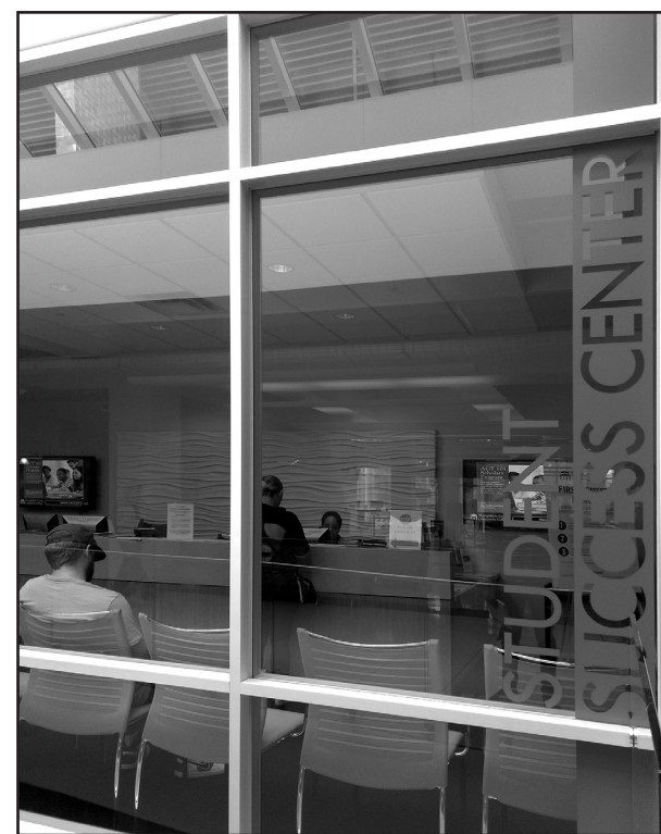
Student Success Center in College Hall on MCCC's Central Campus in Blue Bell

Visit the Student Success Center, located in College Hall on Central Campus, to find out more information about KEYS and the many more ways the College can assist you on your journey to success.