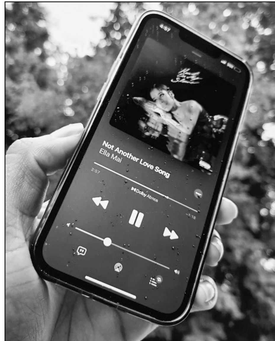
“Heart on My Sleeve” by R&B artist Ella Mai, album cover.

genre is widespread in American culture and even reaches worldwide audiences. Music that impactful is hardly dead.