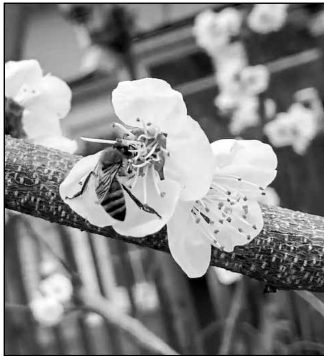
A bee pollinating a tree blossom.

Overall, supporting local honey businesses is not a disservice, but an incentive to appreciate nature’s lasting bounty.