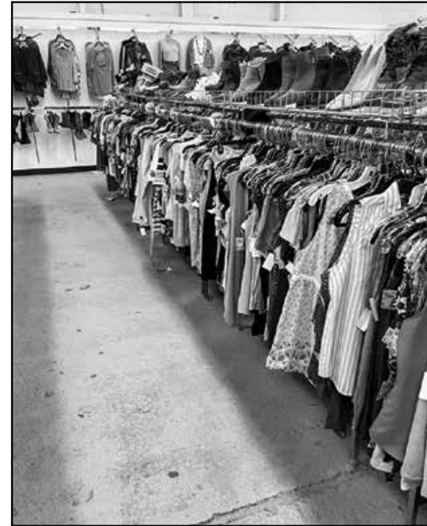
Local thrift store, Liberty Thrift.

Shopping sustainably, while potentially inconvenient and more expensive, is possible to achieve. It can help slow the rise of fast fashion brands and in turn help reduce waste and the negative effects these brands have on the environment.