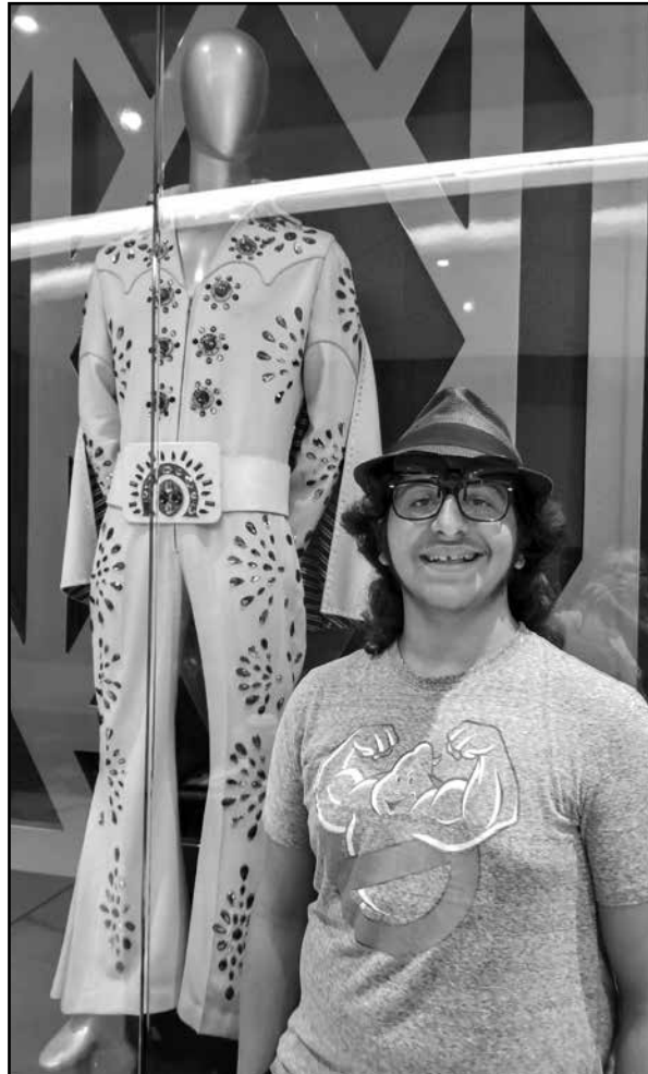
Original Elvis Presley outfit displayed in Atlantic City.

Beside Hanks’ narration, the film falls victim to the same mistake of many biopics. Luhrmann explores what impact Presley had on American culture. At times the audience is overtaken by feelings of nostalgia as Butler magically replicates Elvis’ voice and moves to the music. However, the film could have increased the emotional stakes by exploring how this new fame and image impacted Elvis himself.