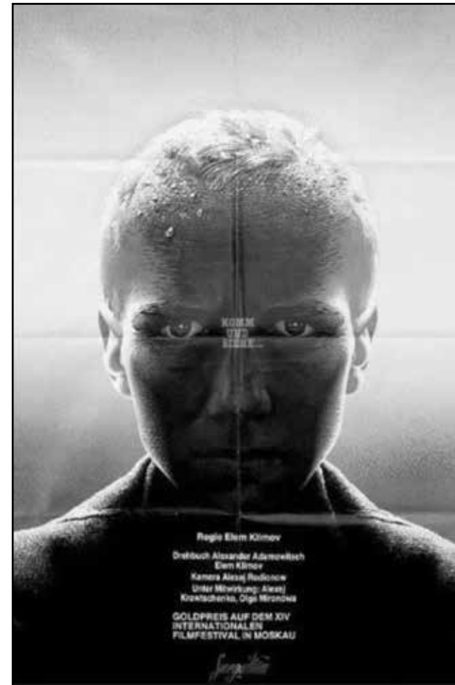
The poster for “Come and See”

atrocious never occurs again. Hopefully, future films will show war for the grim reality it is, rather than exploiting nationalism and glorifying violence.