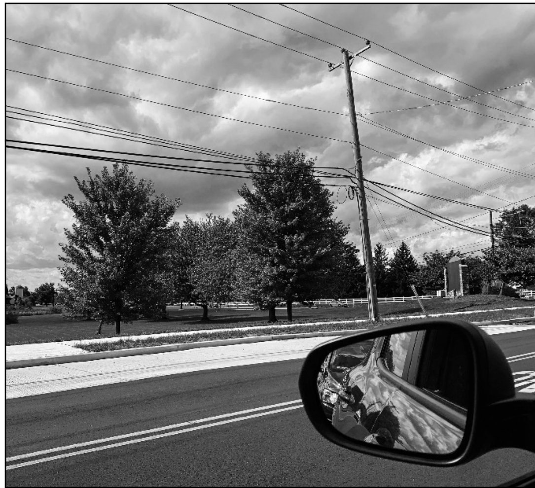
The Outdoors.

So, yes, fall inspires a never-ending love/hate relationship for those who live for the summer life. Some may love the endless beach days and summer playlists. Others will stick to warm coffee and fuzzy socks by a fire. It is all a matter of personal preference.