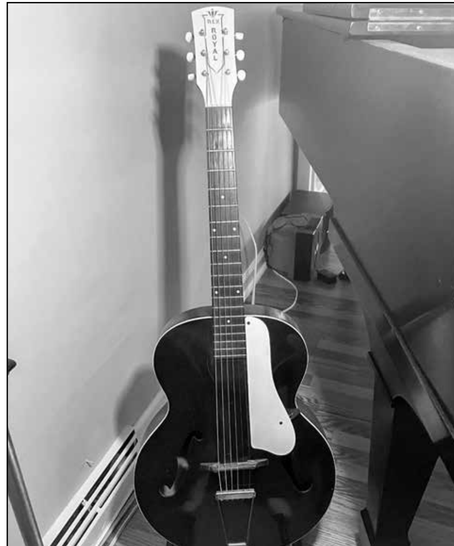
Rex Royal acoustic guitar.

services. Updates on Bubblewrap Princess appear on Instagram under the handle @bwp_phi.