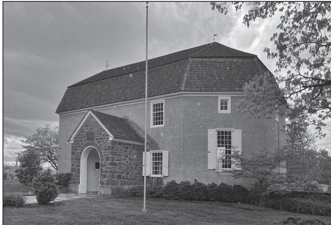
Augustus Lutheran Church in Trappe, Pa., on May 4, 2023.

The Augustus Lutheran Church is a living testament to the long history and enduring legacy of the Lutheran Church in the United States. The beautiful architecture, historic pipe organ, and rich cultural heritage serve as a reminder of the faith, courage, and perseverance of the German immigrants who founded Trappe over two centuries ago. Through community outreach and special events, the church hopes to inspire a new generation of Lutherans to embrace their legacy for many years to come. Their efforts will also garner interest from U.S. history buffs throughout Montgomery County.