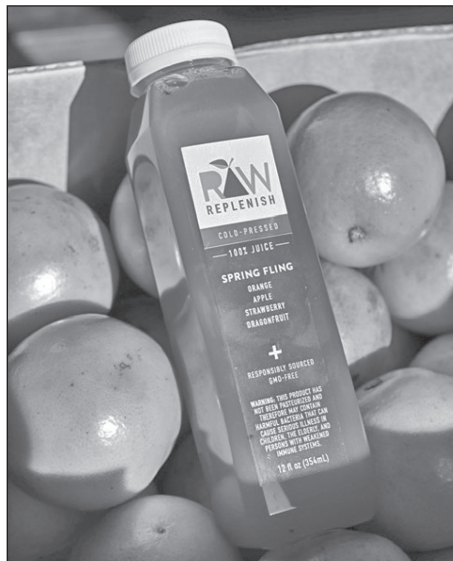
Spring Fling, one of Raw Replenish's more popular products.

Raw Replenish has several locations across the area, including Pennsburg and Souderton. For more information, visit rawreplenish.com .