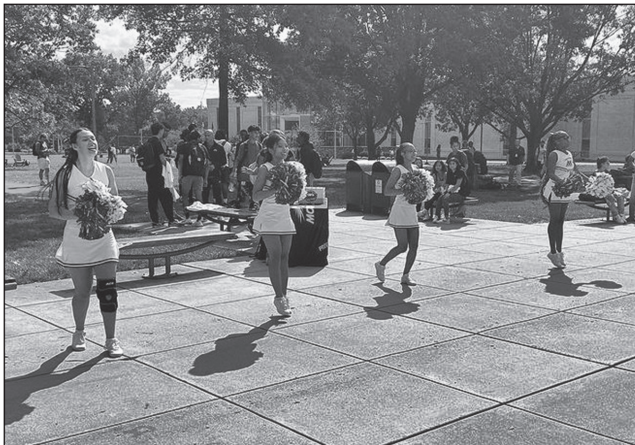
Montco cheerleaders pumping up students outside Parkhouse Hall on October 5, 2023.

Students can also contact the athletic department at athletics@mc3.edu or montcocheer@gmail.com .