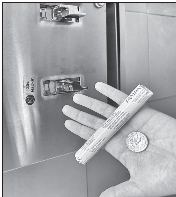
Pad and tampon dispenser located in Parkhouse Hall on September 6, 2023.