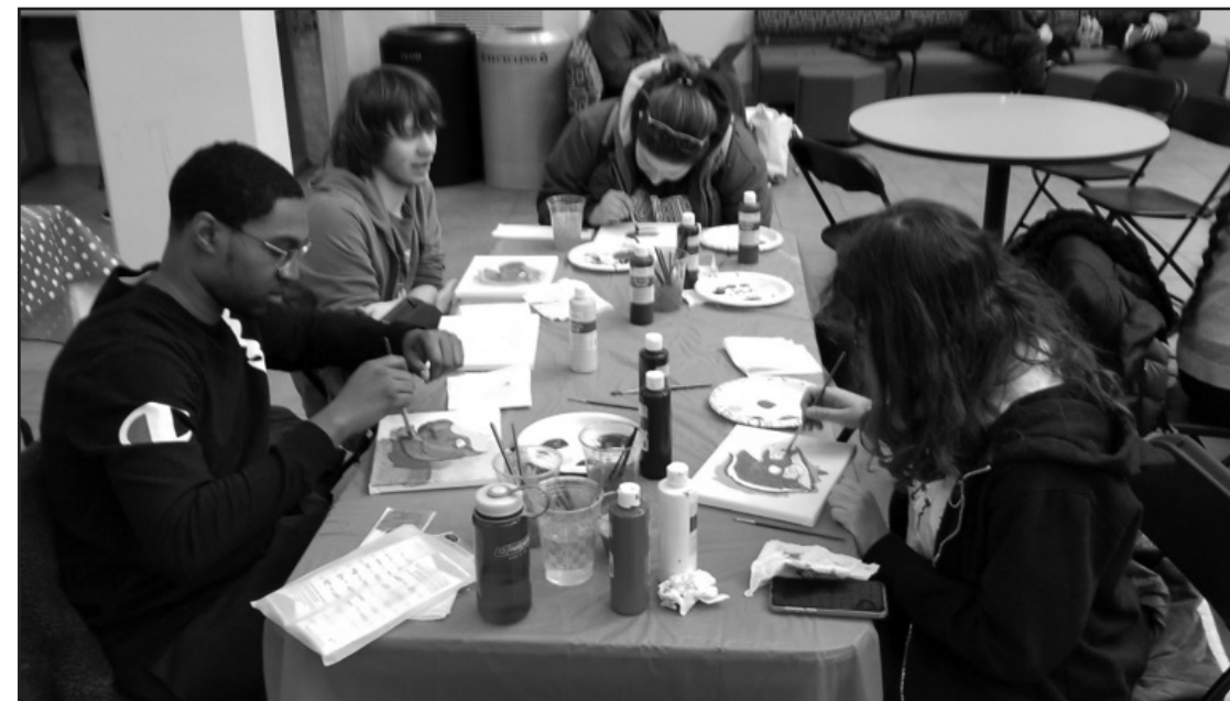
Staff and students, painting Mustangs.