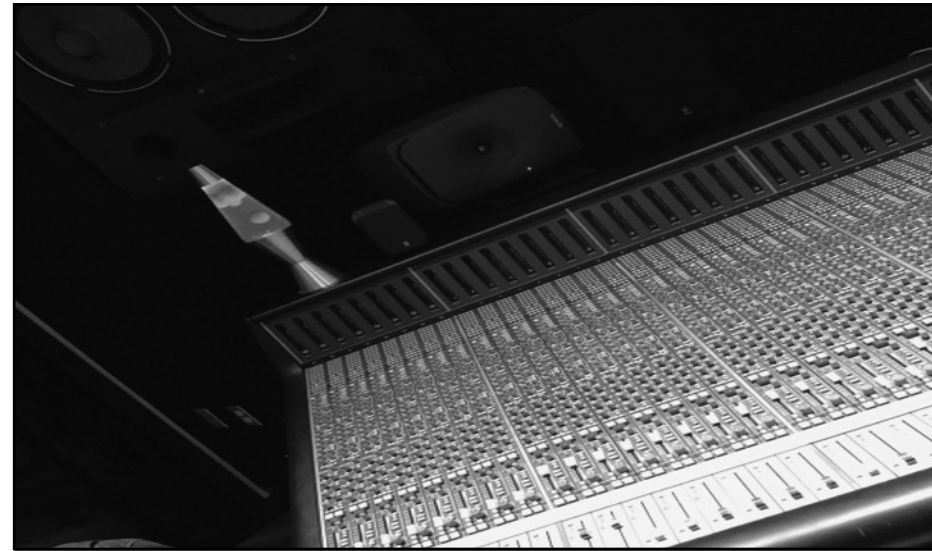
The Mix Room at Central Campus.