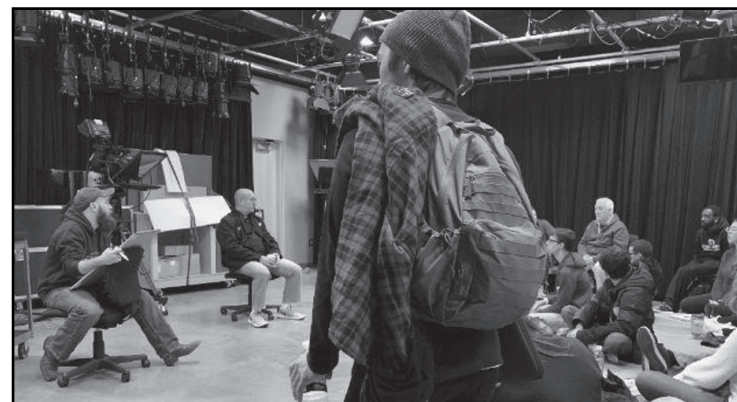
Communicating Arts Production Group (CAPG) Meeting.