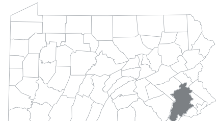
MCCC POTTSTOWN CAMPUS SERVICE REGION, PA

Montgomery County Community College (MCCC) Pottstown Campus creates a significant positive impact on the business community and generates a return on investment to its major stakeholder groups—students, taxpayers, and society. Using a two-pronged approach that involves an economic impact analysis and an investment analysis, this study calculates the benefits received by each of these groups. Results of the analysis reflect fiscal year (FY) 2021-22.