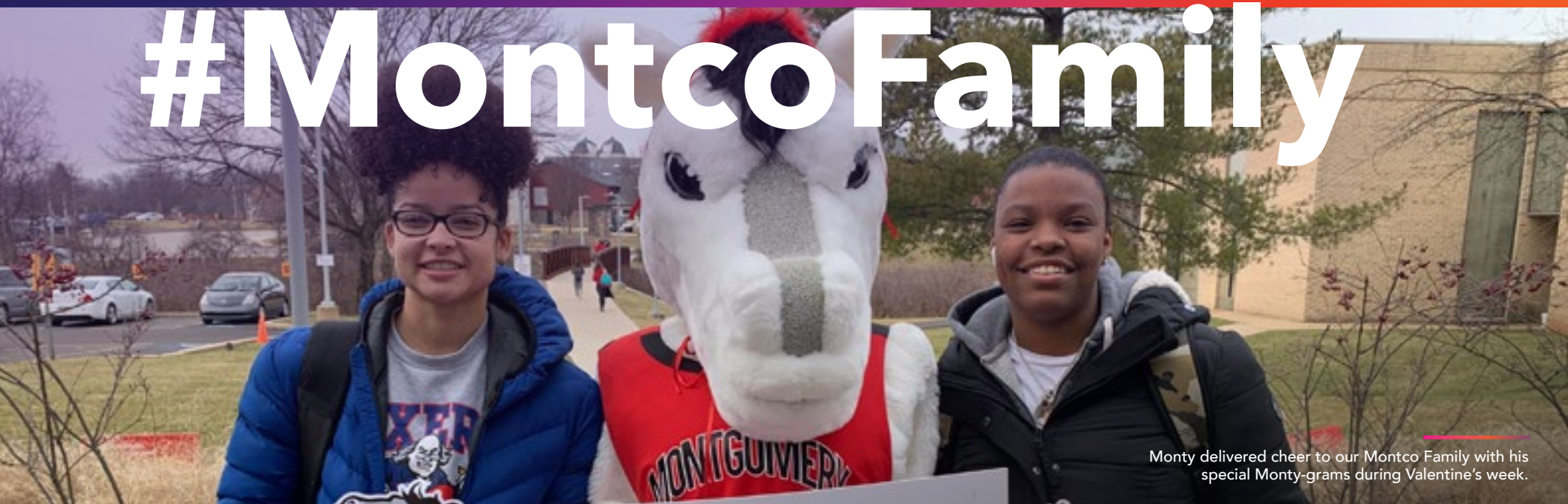
Monty delivered cheer to our Montco Family with his special Monty-grams during Valentine's week.