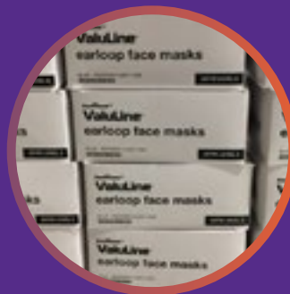
Montco donated a truckload of personal protective equipment to Montgomery County for distribution during the pandemic.

During the primary election in June, Montco's Pottstown Campus served as a secure ballot box drop-off site for voters. Montco also is working with the County to ensure a safe polling location for the general election in November 2020.