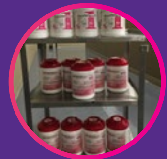
Montco donated hand sanitizer, disinfectant wipes, cotton swabs and gauze for first responders to use in the fight against COVID-19.