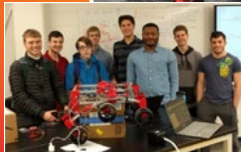
A team of Montco science students created a scale NASA Mars Curiosity Rover that can autonomously travel anywhere on land.