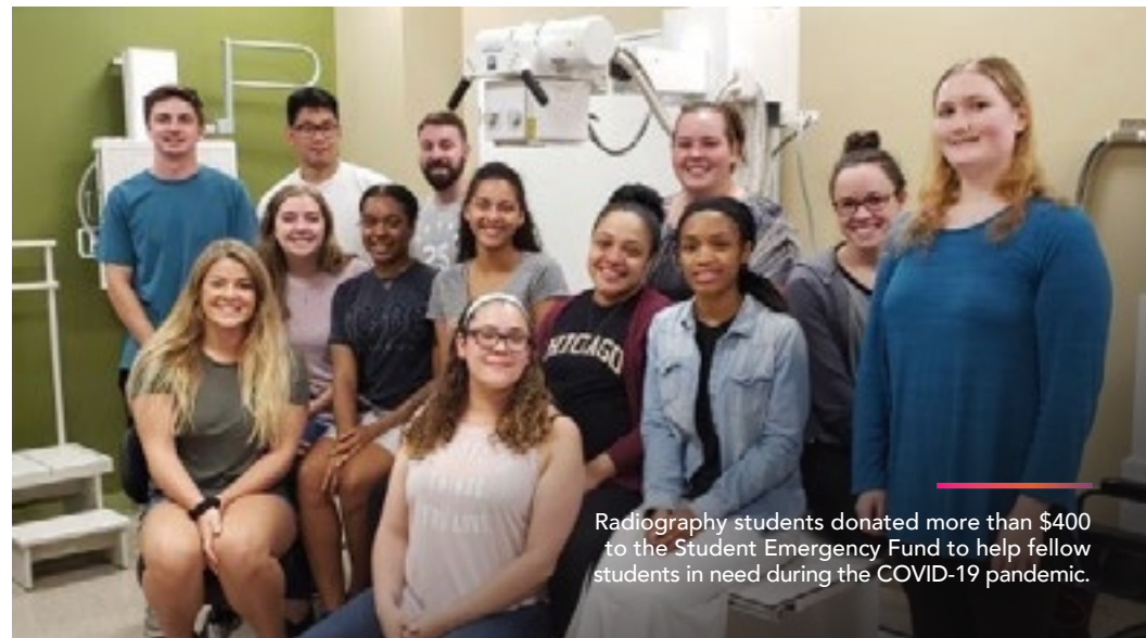
Radiography students donated more than $400 to the Student Emergency Fund to help fellow students in need during the COVID-19 pandemic.