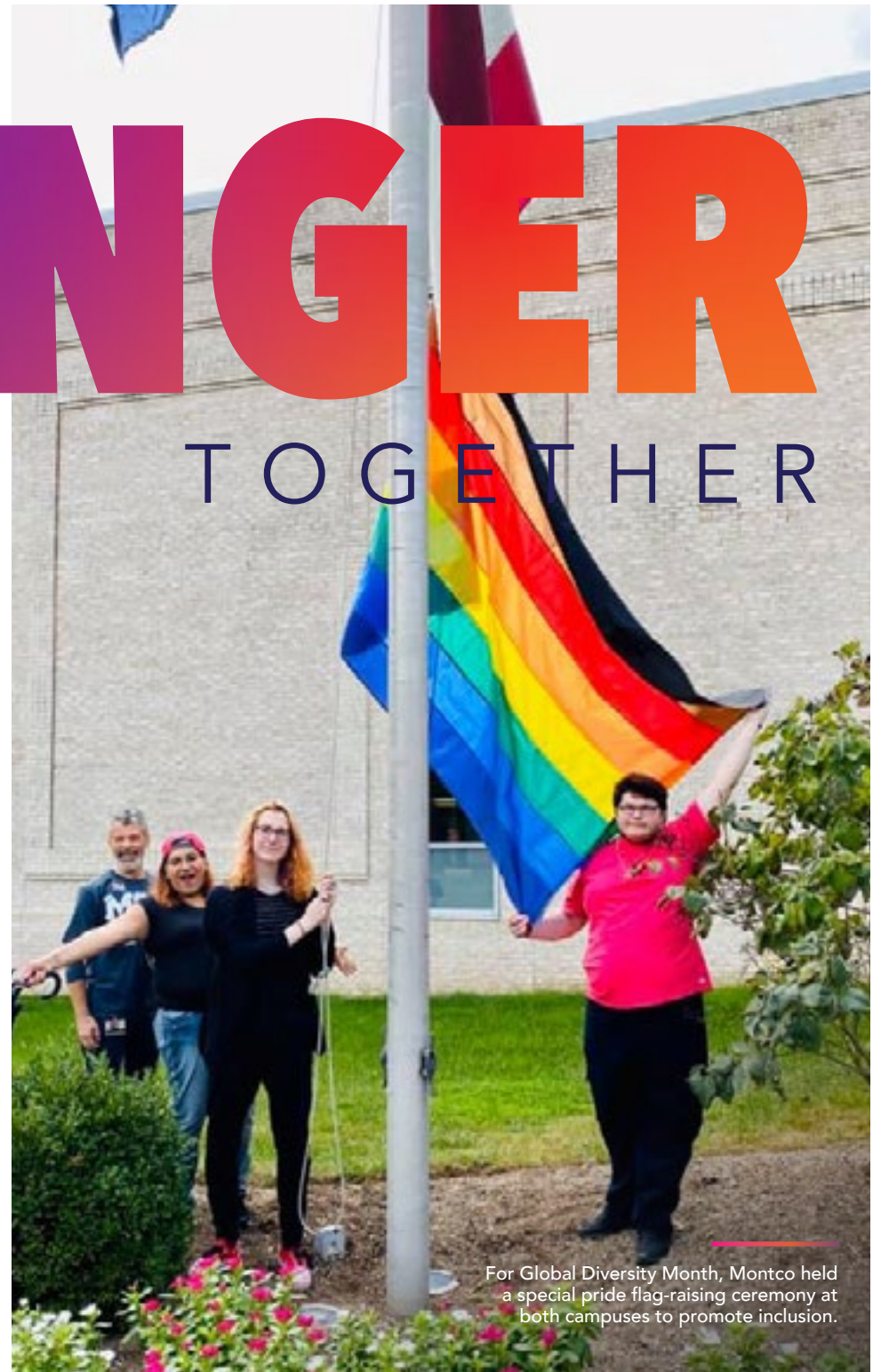
For Global Diversity Month, Montco held a special pride flag-raising ceremony at both campuses to promote inclusion.

For our work in removing barriers to access, improving learning outcomes and increasing completion, Montco has earned national recognition this year as an Achieving the Dream Leader College of Distinction. For the fifth consecutive year, Montco has been named one of the Most Promising Places to Work in Community Colleges in the nation by the National Institute for Staff and Organizational Development, for its commitment to diversity.