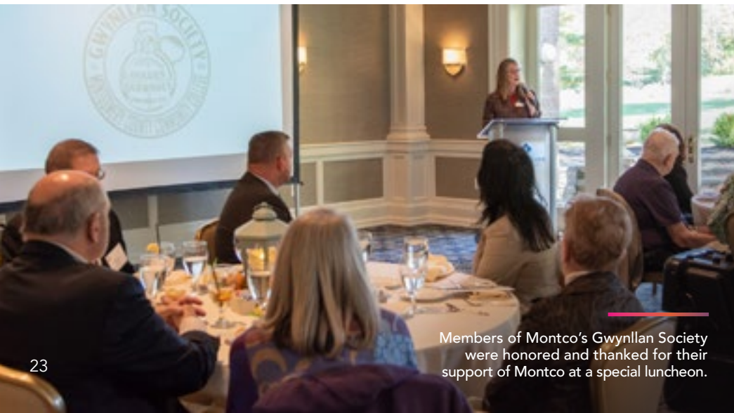
Members of Montco's Gwynllan Society were honored and thanked for their support of Montco at a special luncheon.