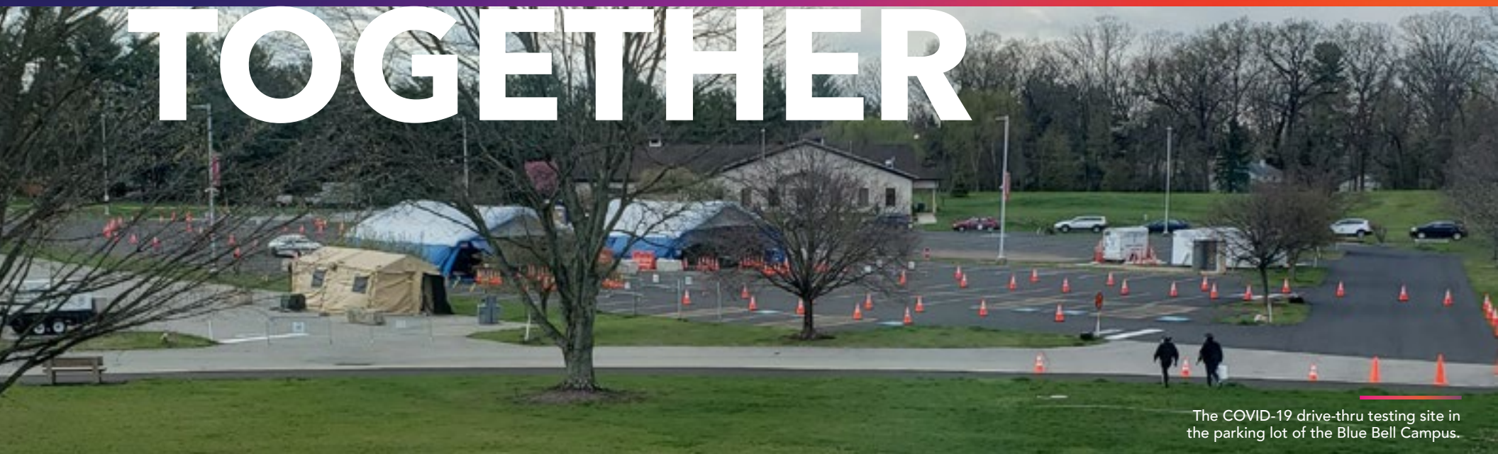
The COVID-19 drive-thru testing site in the parking lot of the Blue Bell Campus.

The COVID-19 pandemic drastically changed how Montgomery County Community College completed work beginning in the second half of the spring semester. Collegewide, with physical facilities shuttered, the College was forced to operate remotely.