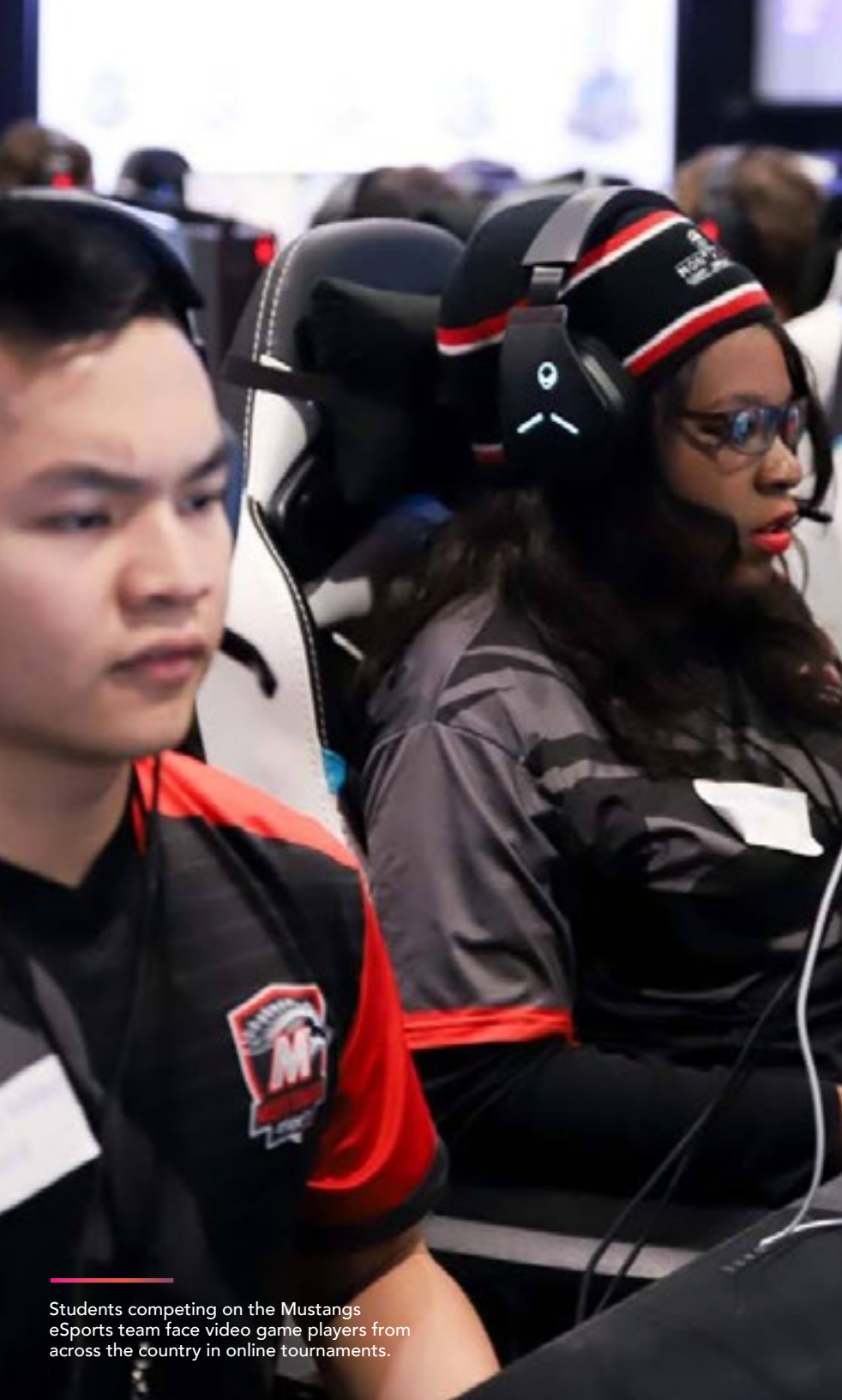
Students competing on the Mustangs eSports team face video game players from across the country in online tournaments.