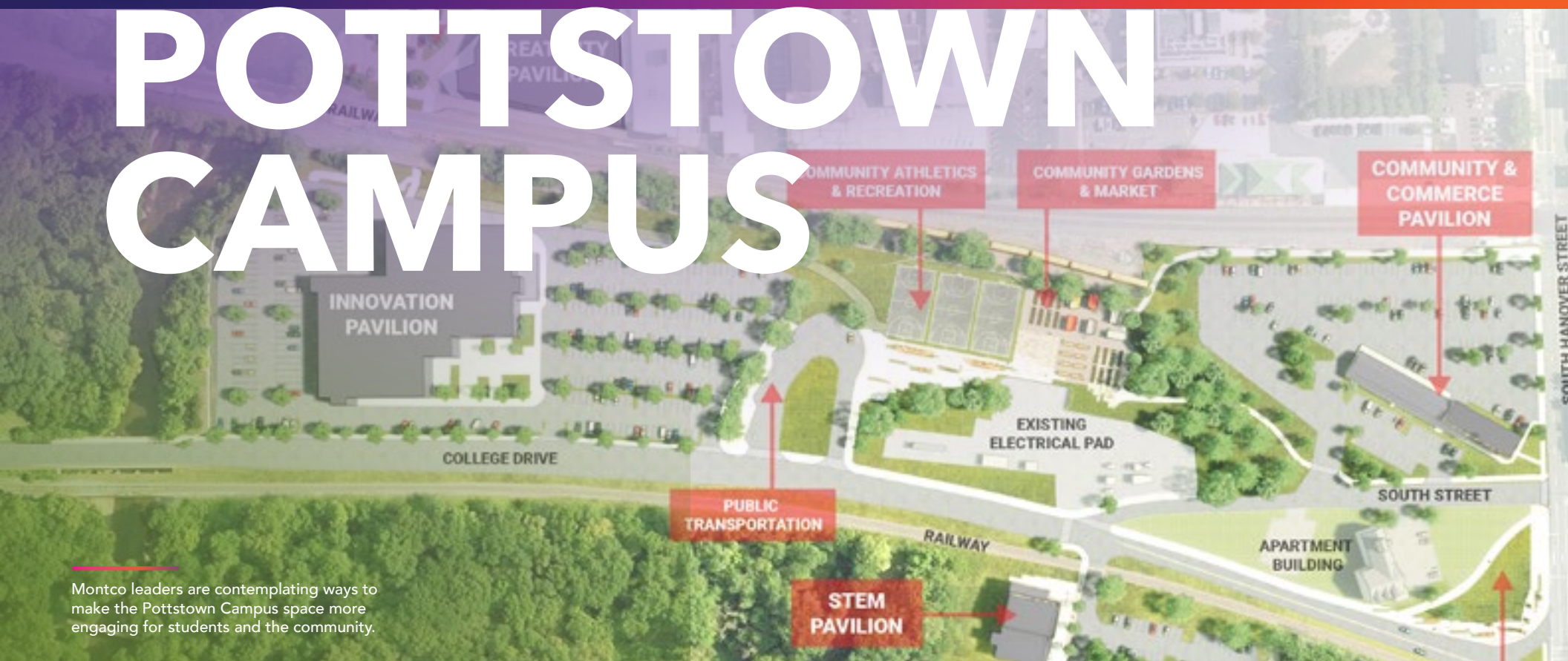
Montco leaders are contemplating ways to make the Pottstown Campus space more engaging for students and the community.