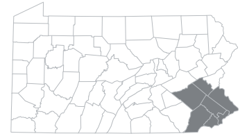
THE MCCC SERVICE AREA, PA

Montgomery County Community College (MCCC) creates a significant positive impact on the business community and generates a return on investment to its major stakeholder groups—students, taxpayers, and society. Using a two-pronged approach that involves an economic impact analysis and an investment analysis, this study calculates the benefits received by each of these groups. Results of the analysis reflect fiscal year (FY) 2020-21.