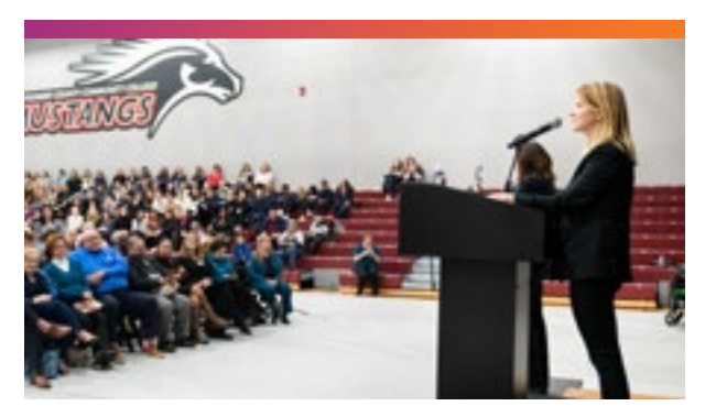
More than 1,400 people attended the 2019 Presidential Symposium on Diversity featuring author of Educated , Dr. Tara Westover.