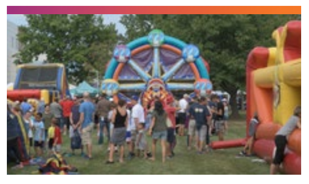
More than 7,000 visitors attended the annual Whitpain Community Festival in 2019 co-hosted by Montco and Whitpain Township.