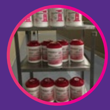
Montco donated hand sanitizer, disinfectant wipes, cotton swabs and gauze for first responders to use in the fight against COVID-19.