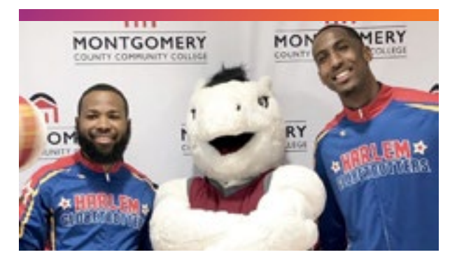
Montco partners with the Valley Forge Tourism & Convention Board to offer events like the Harlem Globetrotters for the community.

As the community's college, Montco partners with many organizations, businesses, school districts, and other private and public entities to serve the residents of the County and region.