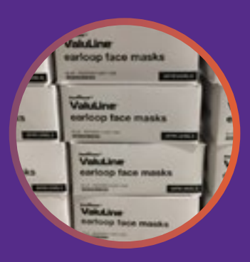
Montco donated a truckload of personal protective equipment to Montgomery County for distribution during the pandemic.

During the primary election in June, Montco's Pottstown Campus served as a secure ballot box drop-off site for voters. Montco also is working with the County to ensure a safe polling location for the general election in November 2020.