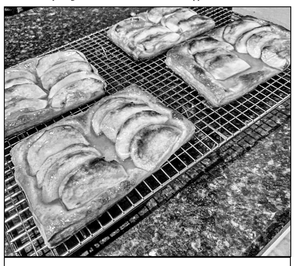
French Apple Tarts.