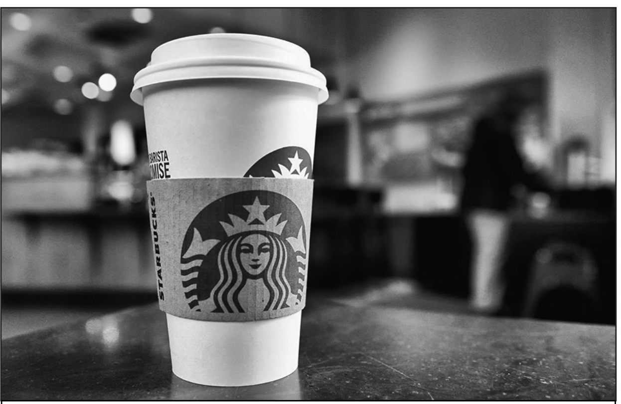
My most recent Starbucks coffee

I continue to be heartbroken by the link between politics and coffee in the country where I was born. Peace is certainly the most important need in Burma before welcoming global brands, but these investments can help foster positive economic growth and lift people out of poverty, thereby granting them better lives. Starbucks may seem like something very simple to most of my classmates, but I will not take it for granted. I hope everyone in my home country can enjoy a cup soon as well.