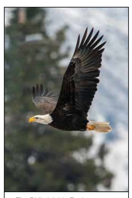
The Philadelphia Eagles mascot.